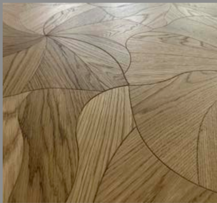
Pattern #1 Oak

3 O A K N U A N C E S A V A I L A B L E O N H I G H H O N E D S U R F A C E F I N I S H .