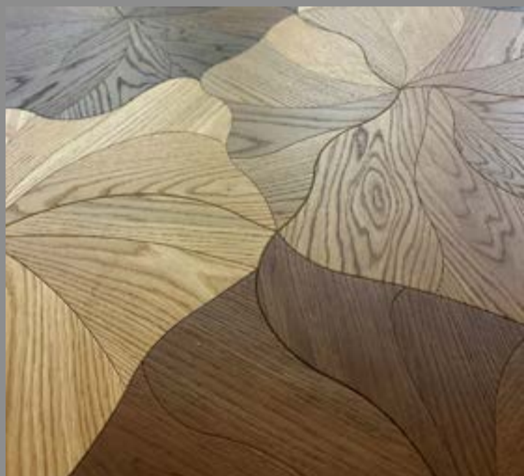
Pattern #2 Oak natural Oak 120° Oak 157°